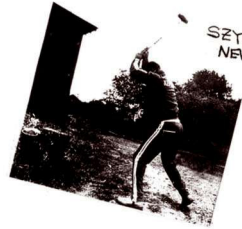
SZYMCZYK INTRODUCES NEW SPLICING TECHNIQUE.